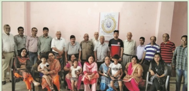
MS Ambala City Monthly Meeting on 7 April 2019