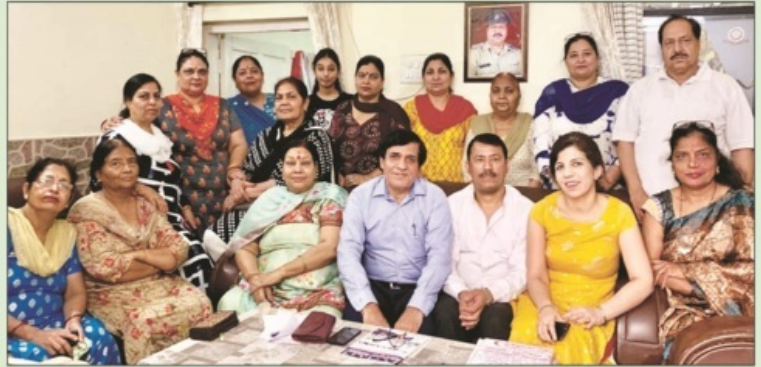
MS West Zone Monthly Meeting on 7 April 2019