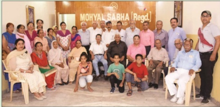
MS Faridabad Monthly Meeting on 7 April 2019