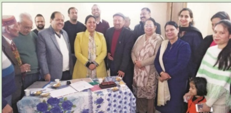
MS Mehrauli Monthly Meeting on 7 March 2019