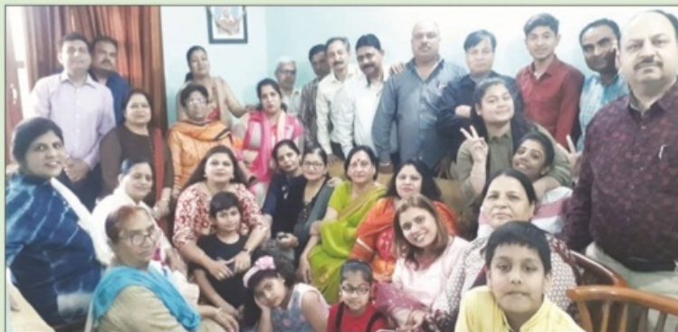
MS Panipat Monthly Meeting on 24 March 2019