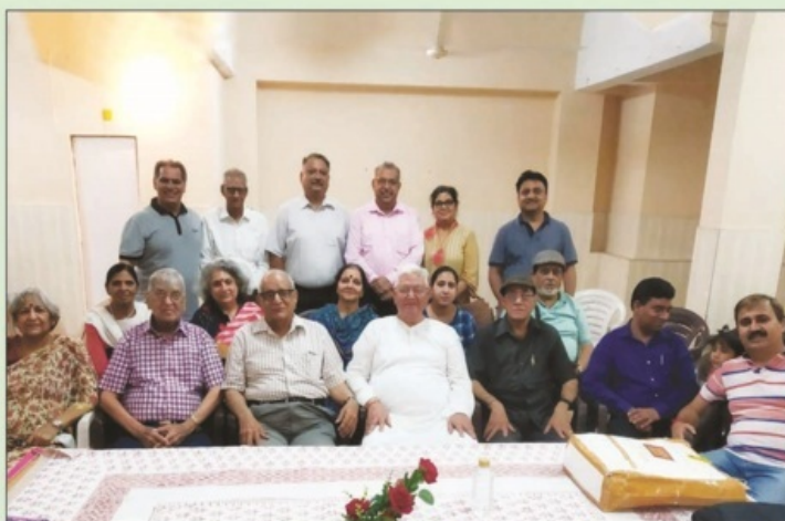
MS Rohini Pitampura Monthly Meeting on 21 April 2019