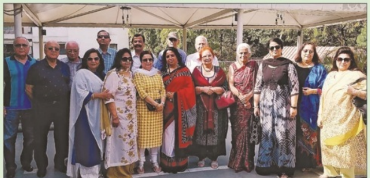
MS South Zone Monthly Meeting on 24 March 2019