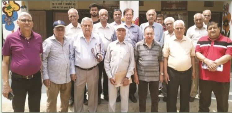
MS Gurgaon Monthly Meeting on 7 April 2019