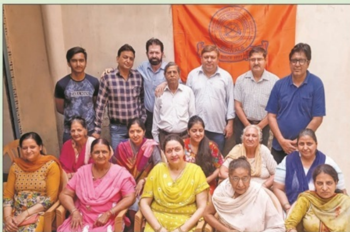
MS Yamuna Paar Monthly Meeting on 7 April 2019