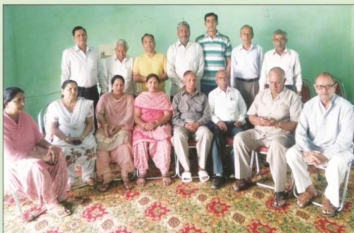
MS Jagadhari Workshop Monthly Meeting on 7 April 2019