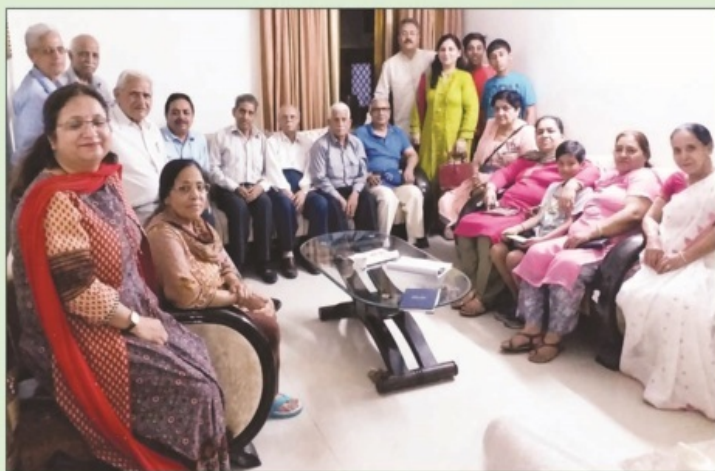
MS Paschim Vihar Monthly Meeting on 31 March 2019