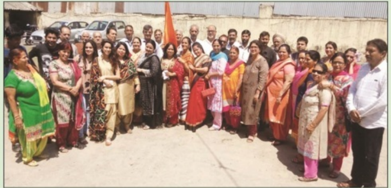
MS Dehradun & MS Prem Nagar Dehradun celebrated Baisakhi on 21 April 2019